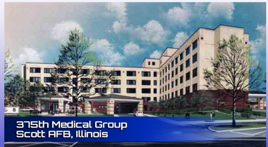
375th Medical Group Scott AFB, Illinois